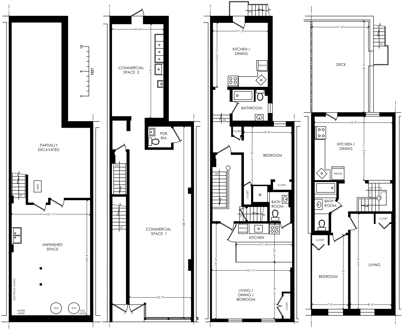
BASEMENT FLOOR AREA: 941 SQ. FT. MAIN FLOOR FLOOR AREA: 913 SQ. FT. SECOND FLOOR FLOOR AREA: 955 SQ. FT. THIRD FLOOR FLOOR AREA: 696 SQ. FT.